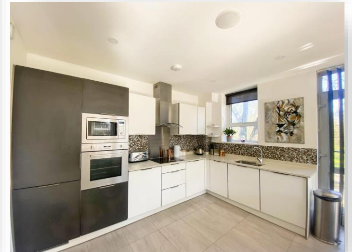
Cathedral Road, Cardiff CF11 9FH