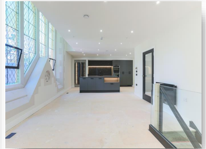
Pen Y Fal Chapel, Sycamore Avenue Abergavenny NP7 5JY