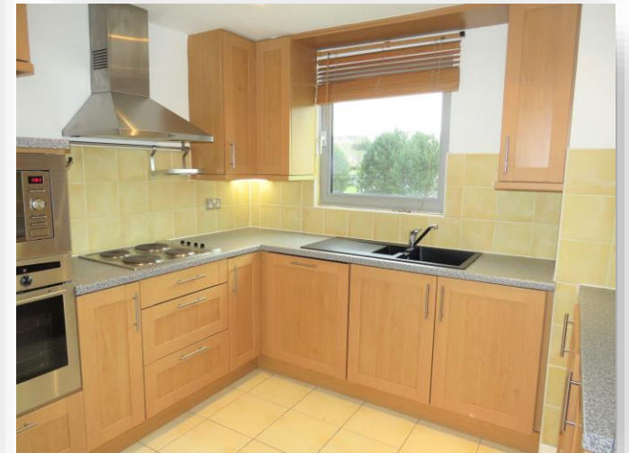
Ty Devonia, Pierhead View, Penarth, CF64 1SJ