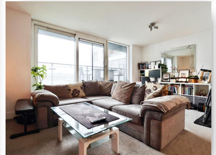
Caldey Island House, Ferry Court, Cardiff, CF11 0JN