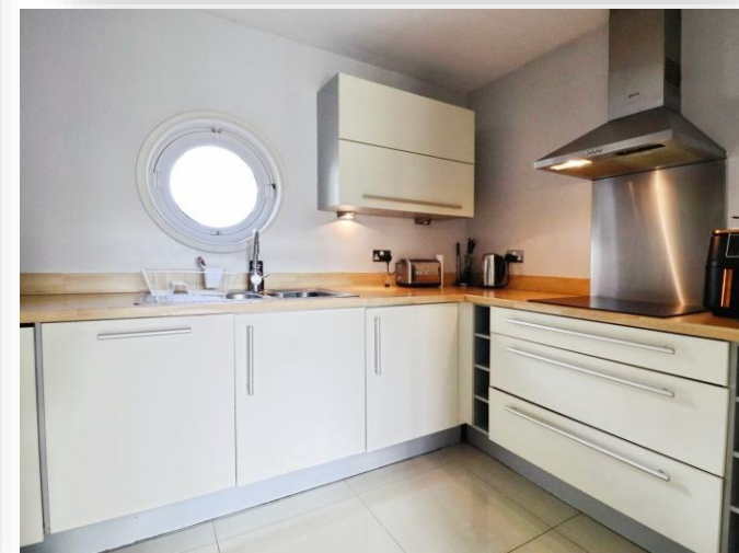
Beatrix, Victoria Wharf, Cardiff, CF11 0SE