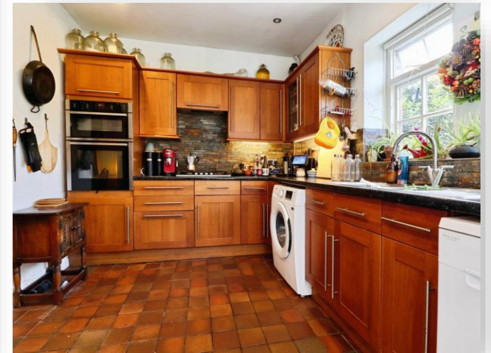
Oakland Cottage, Tower Hill, Penarth, CF64 3BJ