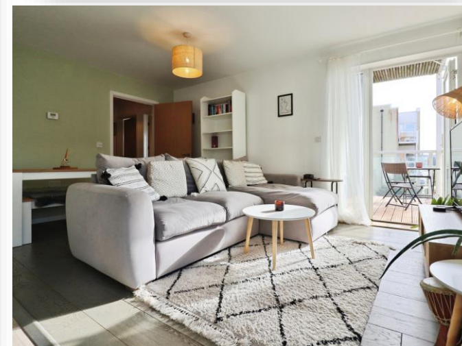
Pearse Close, Penarth, CF64 1TH