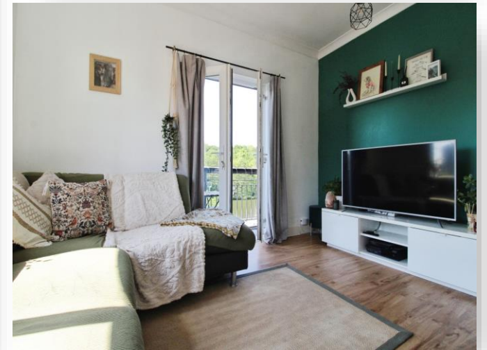
Grangemoor Court, Cardiff CF11 0AE