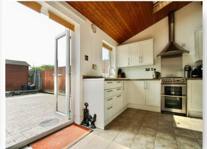
Railway Terrace, Dinas Powys, CF64 4LJ