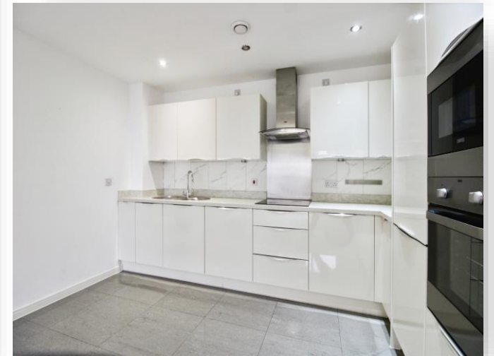
Davaar House, Ferry Court, Cardiff, CF11 0LA