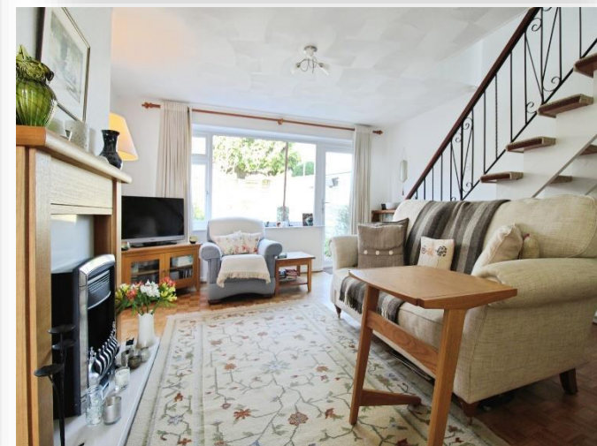
Uplands Crescent, Llandough, Penarth, CF64 2PS