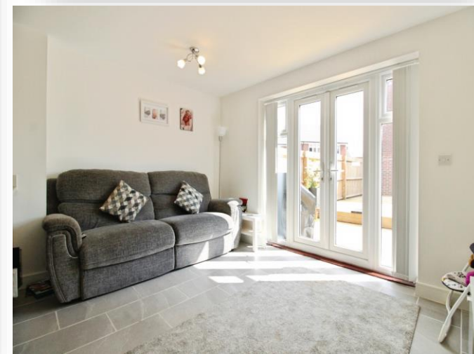
Castle Wood Road, Sully, Penarth, CF64 5WP