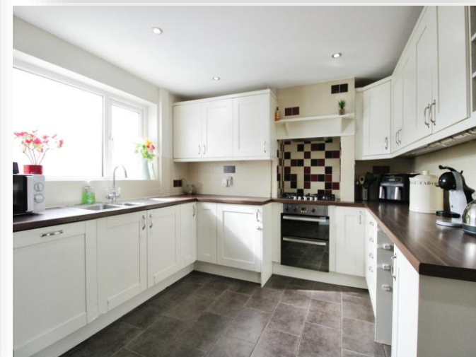
Dowland Road, Penarth, CF64 3QX