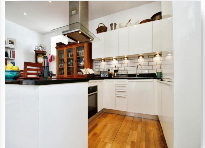
Courtlands, Hayes Road, Sully, PENARTH, CF64 5QG