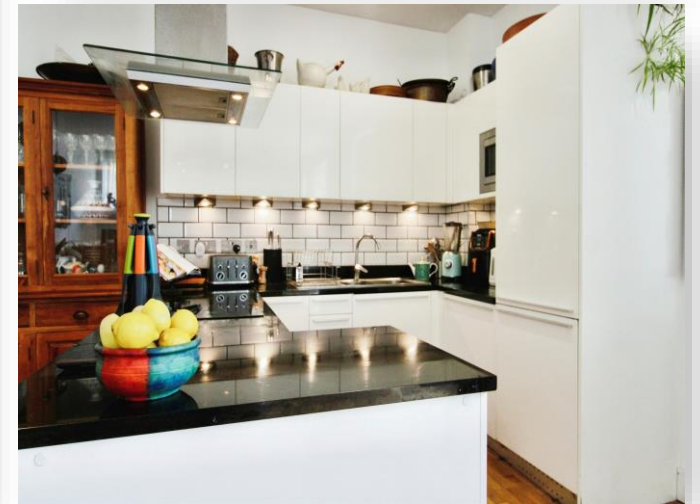
Courtlands, Hayes Road, Sully, PENARTH, CF64 5QG