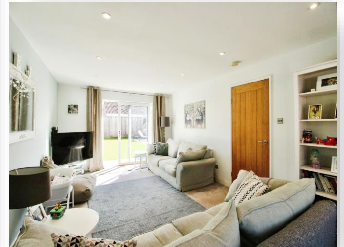
Cog Road, Sully, Penarth, CF64 5TE