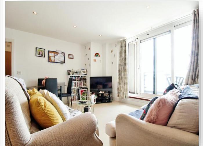
Breakwater House, Ferry Court, Cardiff, CF11 0JQ