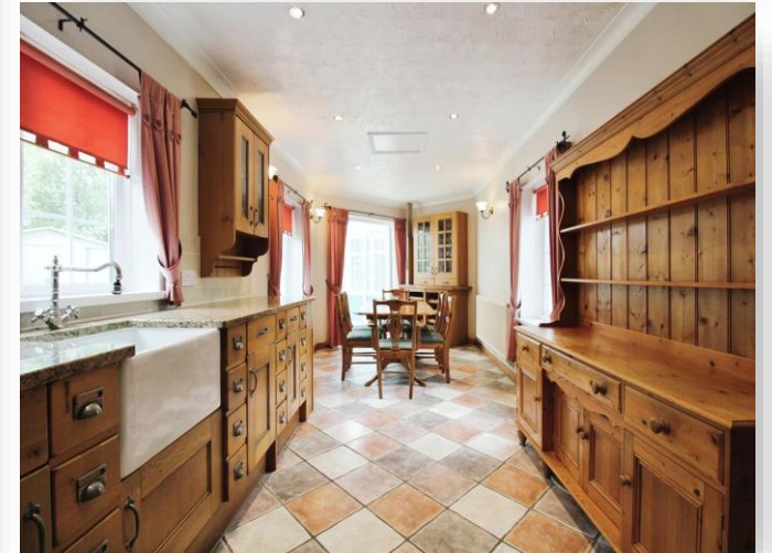
Maes Y Ffynnon, Bonvilston, Cardiff, CF5 6TT