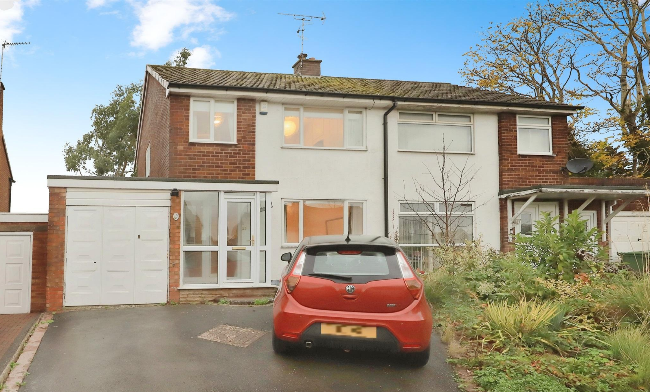
The Greenway, Hagley, STOURBRIDGE, DY9 0LT