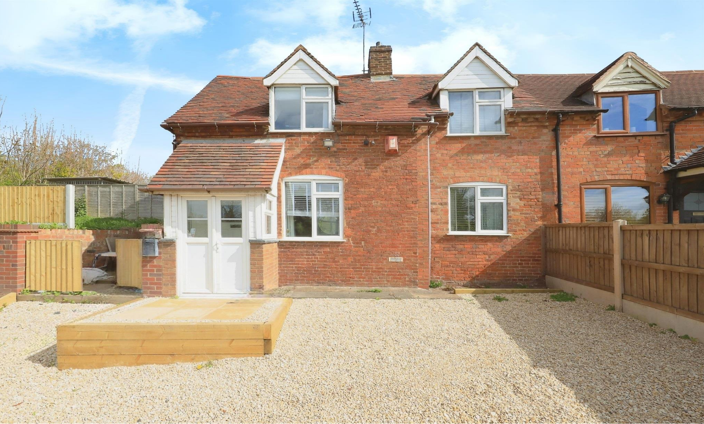
Bell End Cottages, Bromsgrove Road, Belbroughton, Stourbridge, DY9 9UJ