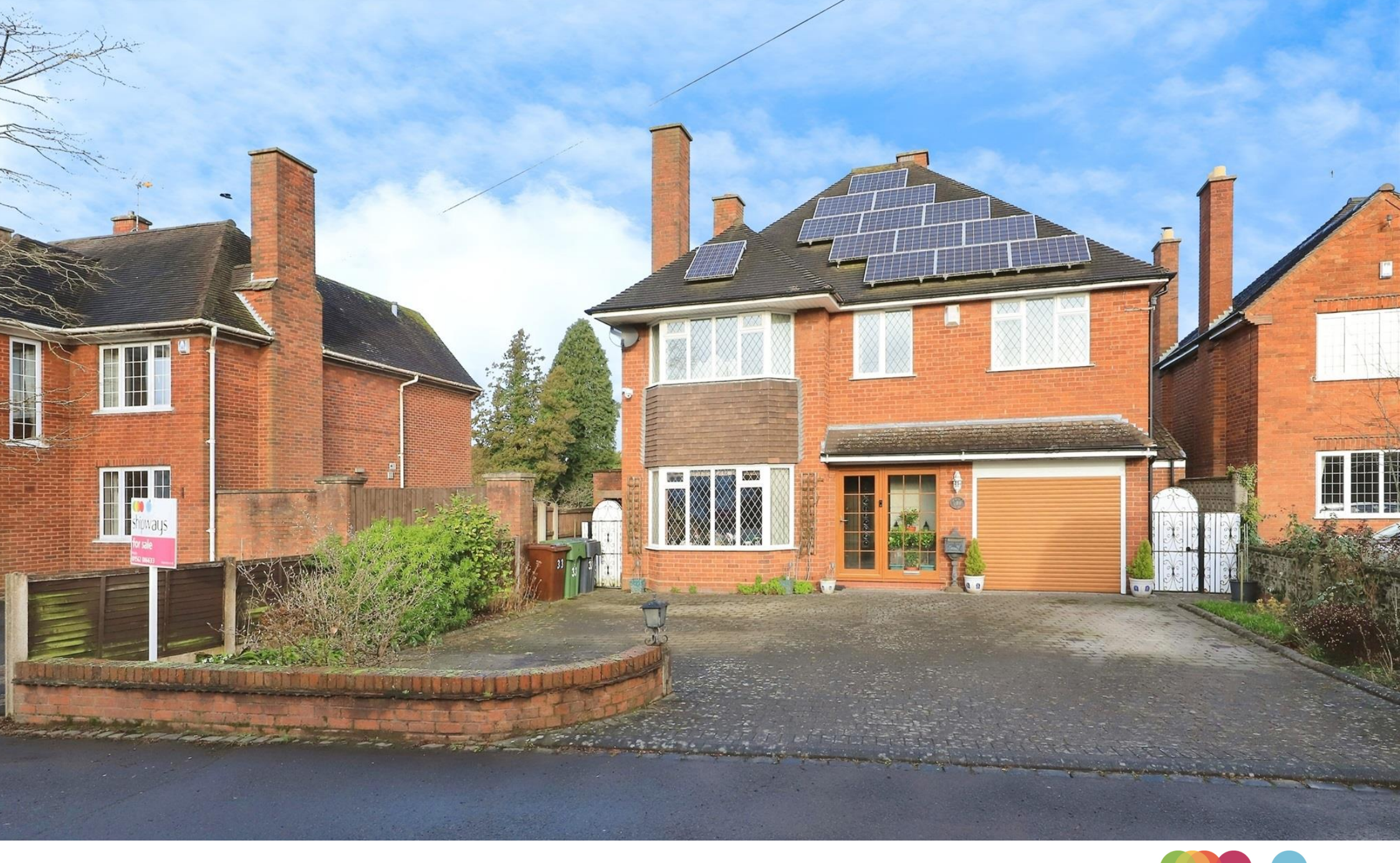
Kidderminster Road, Hagley, Stourbridge, DY9 0PZ