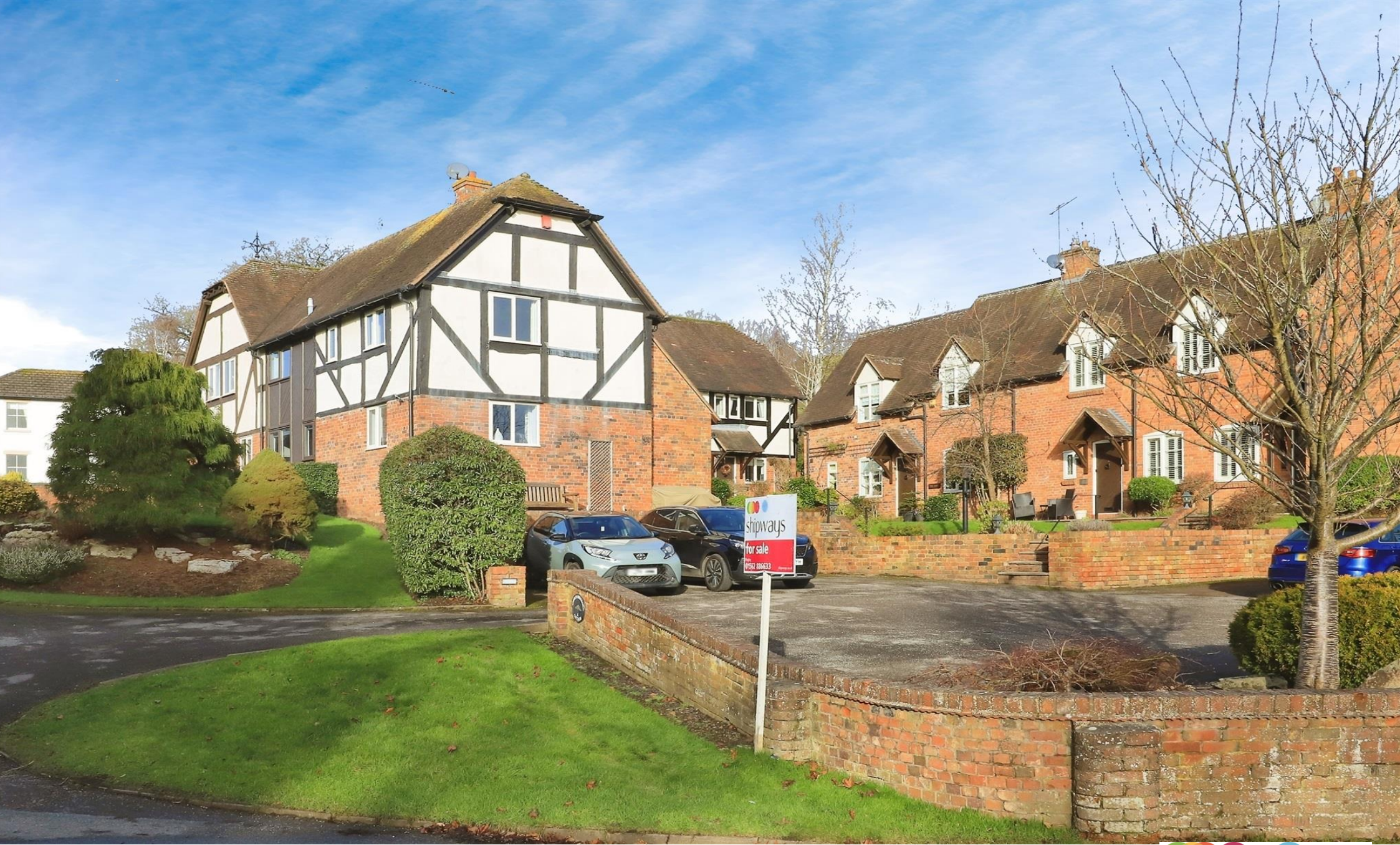
The Old Barn Church Hill, Kidderminster DY10 3LY