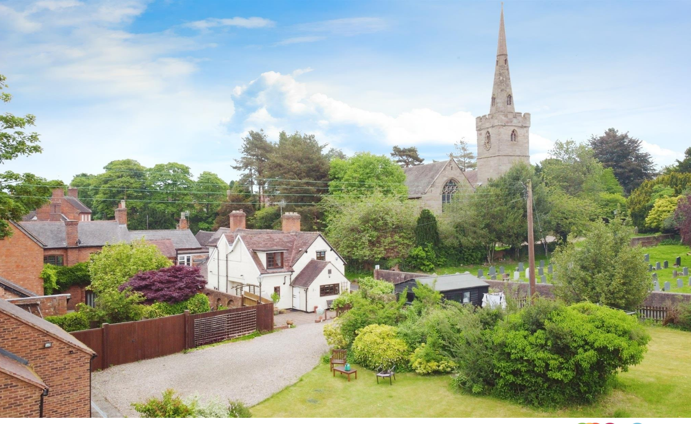
Church Hill, Belbroughton, Stourbridge, DY9 0DT