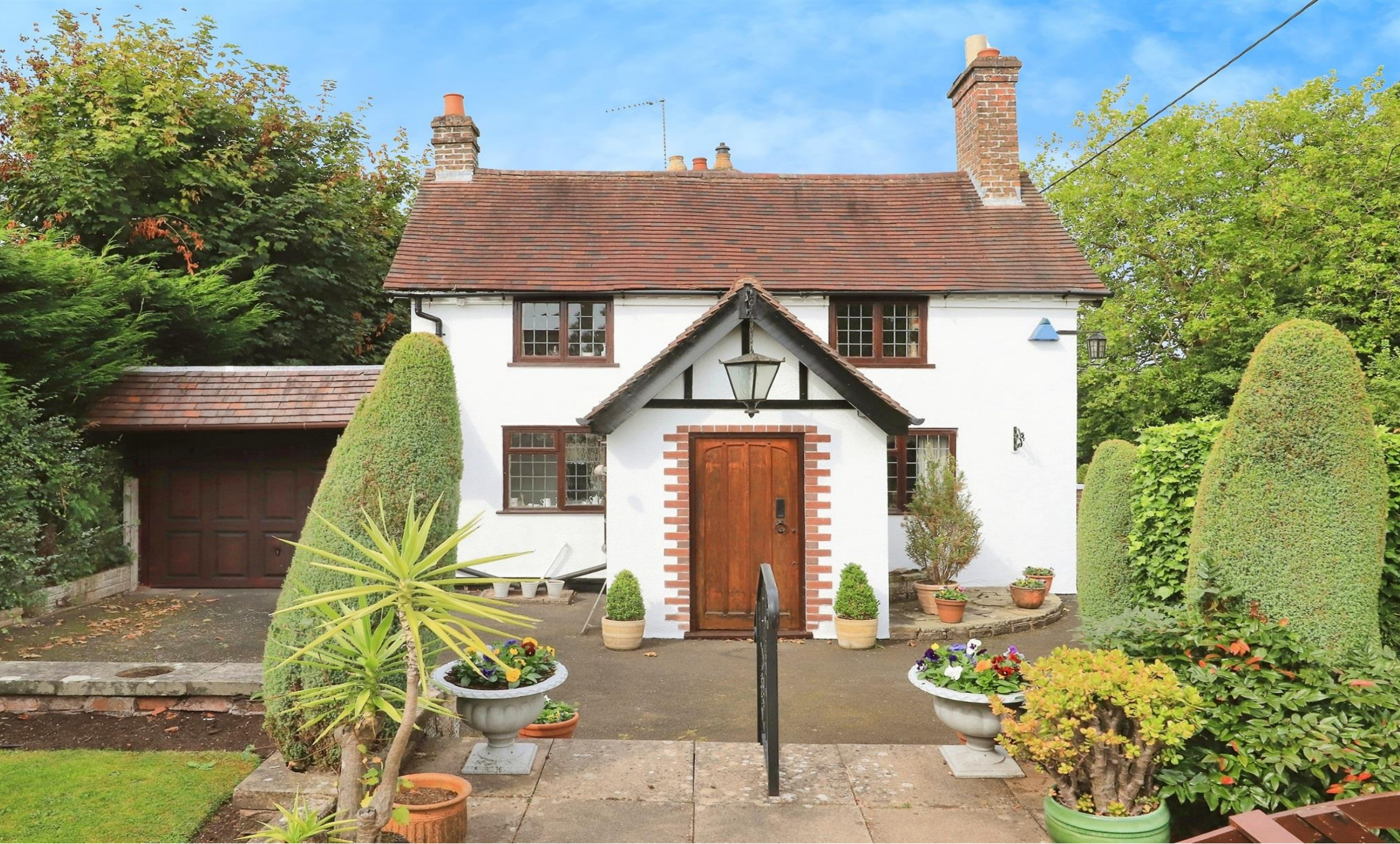
Brake Lane Cottage, Brake Lane, Hagley, Stourbridge, DY8 2XW