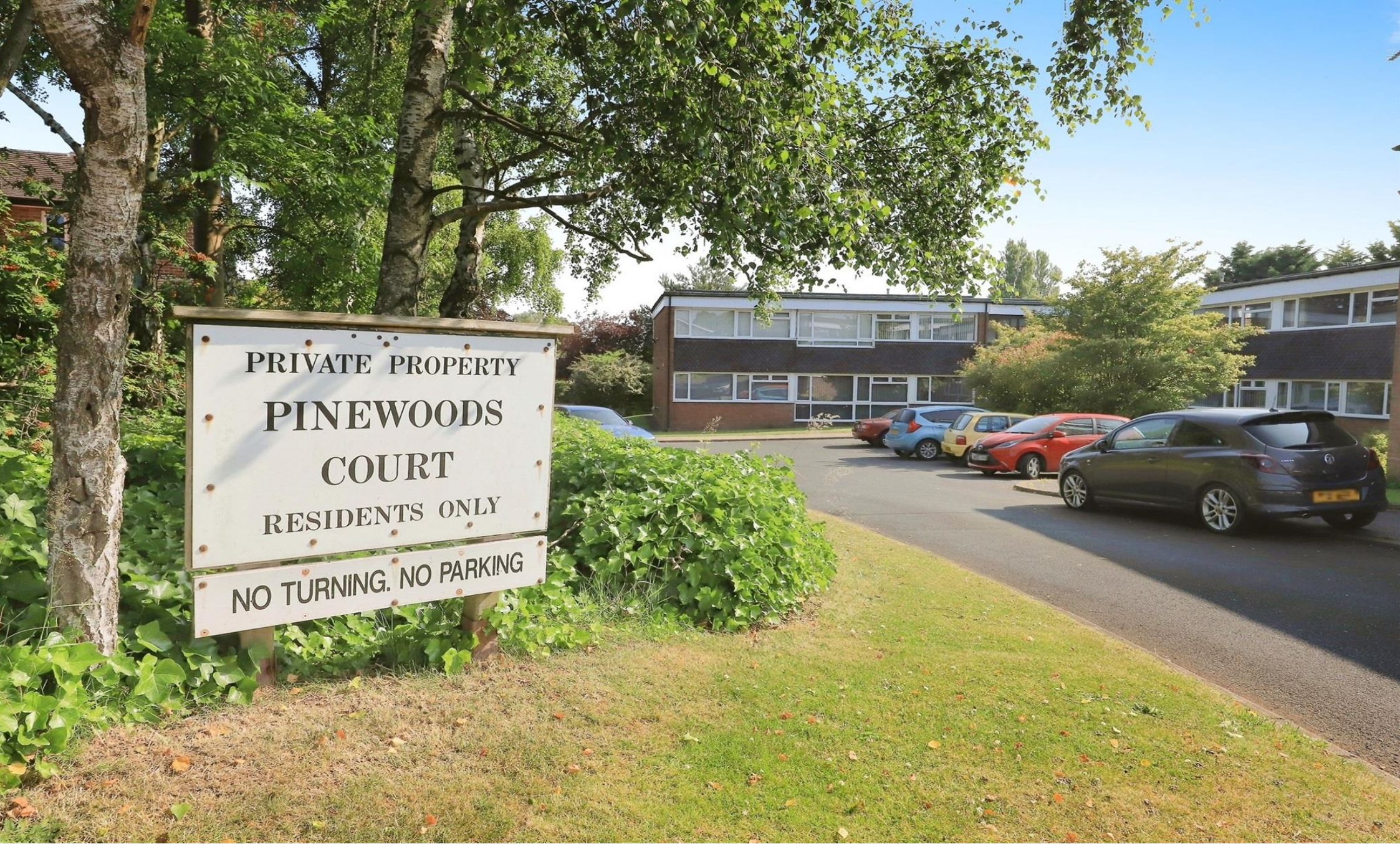
Pinewoods Court, Hagley Stourbridge DY9 0JQ