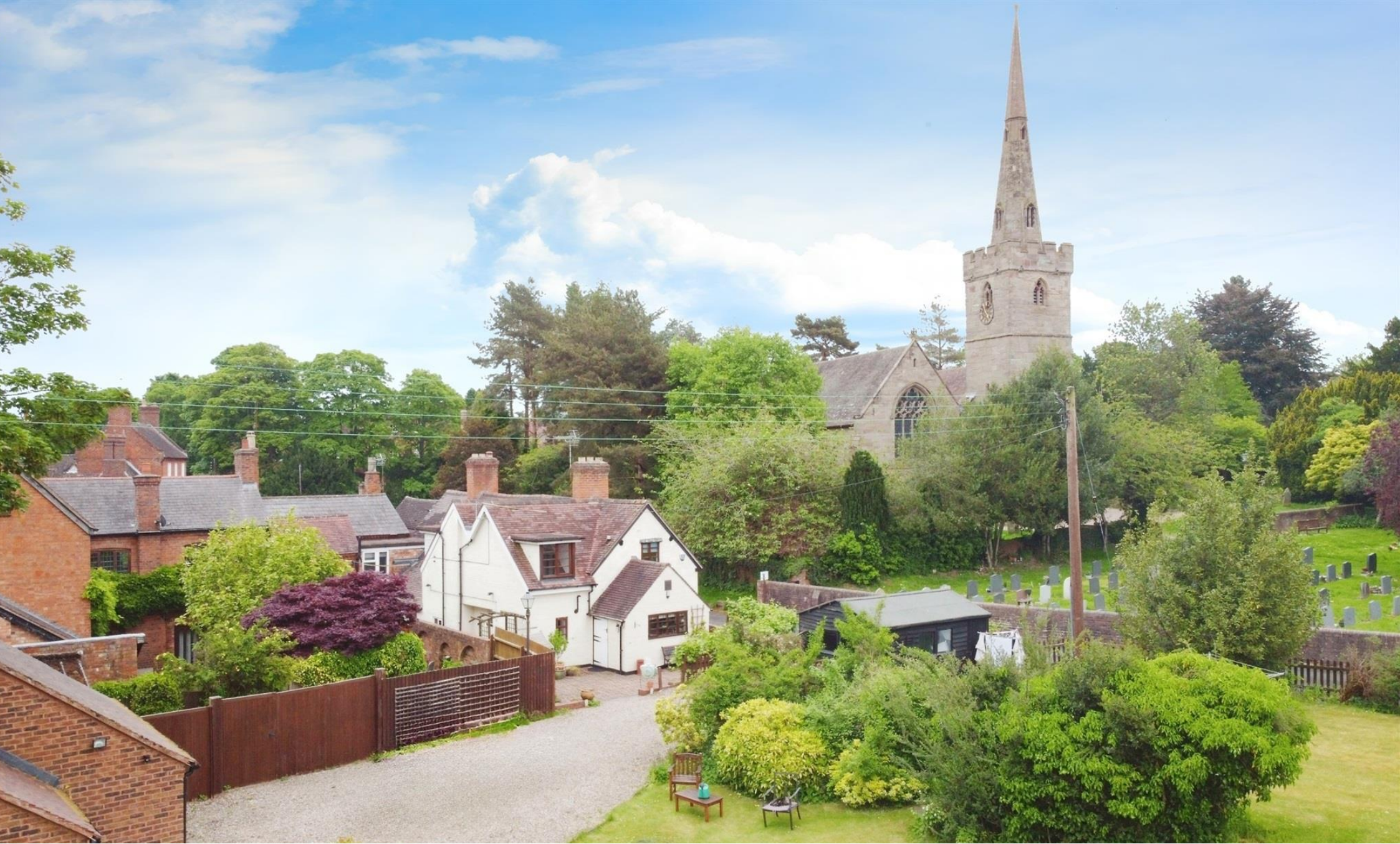
Church Hill, Belbroughton, Stourbridge, DY9 0DT