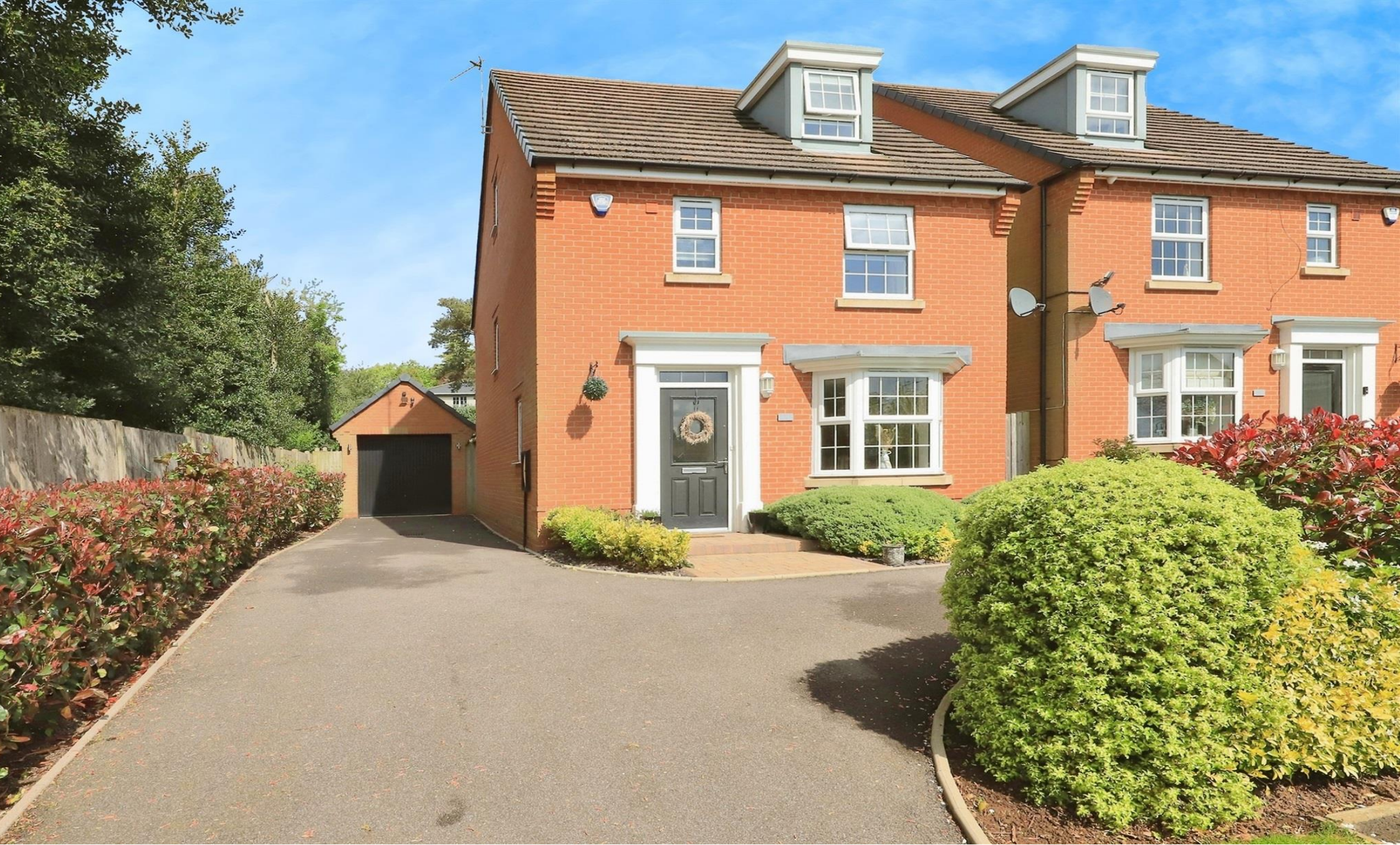
Prince Mews, Hagley, Stourbridge, DY9 0FT