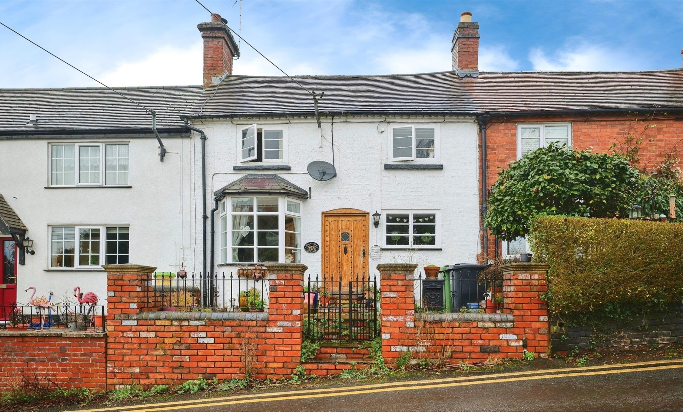
Springvale Cottage Adams Hill, Clent Stourbridge DY9 9PS