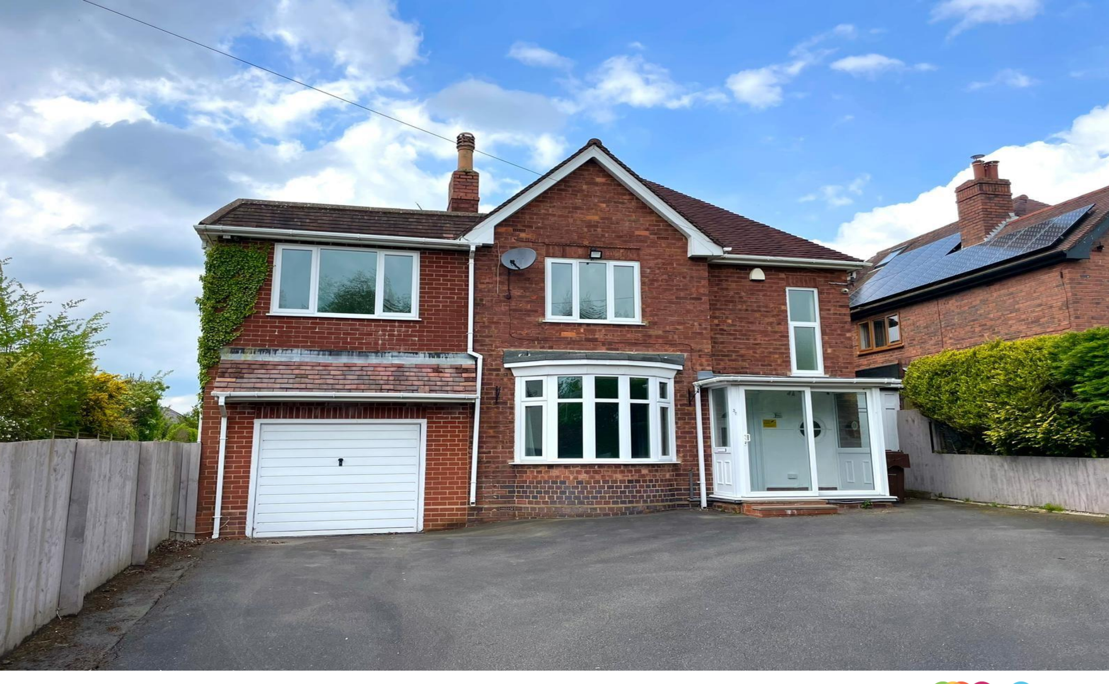
Holy Cross Lane, Belbroughton Stourbridge DY9 9SH