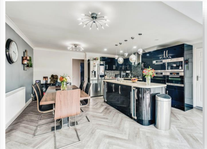
Heyford Hill Lane, Sandford On Thames Oxford OX4 4YG