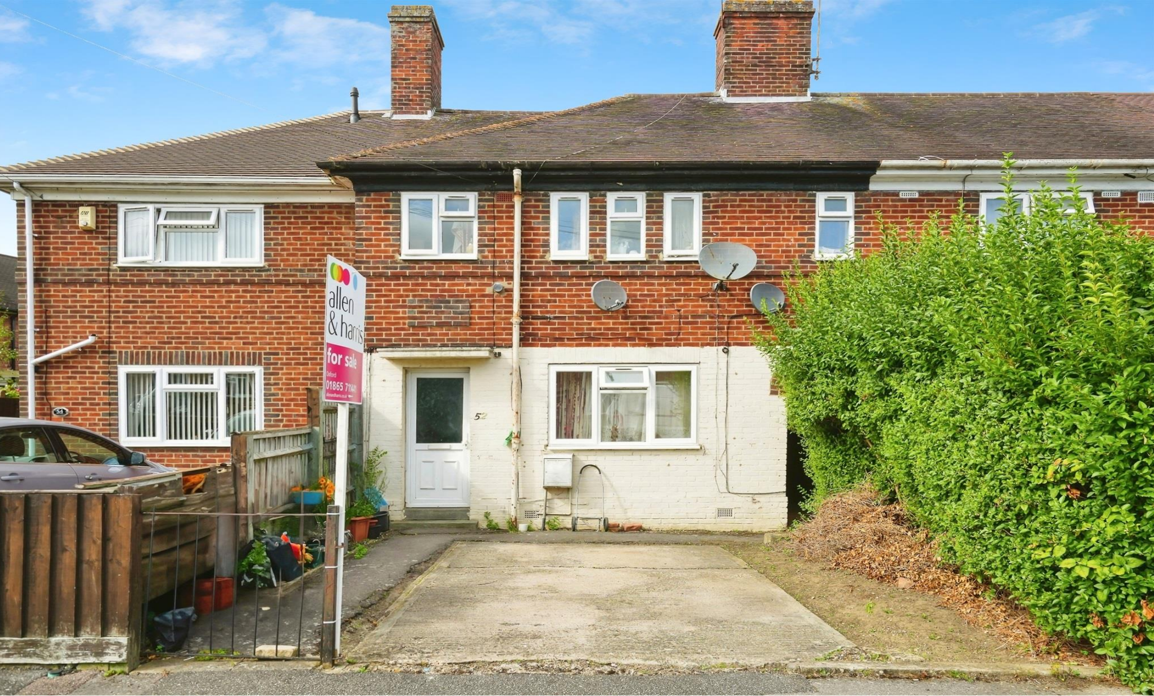
Dashwood Road, Oxford OX4 4SJ