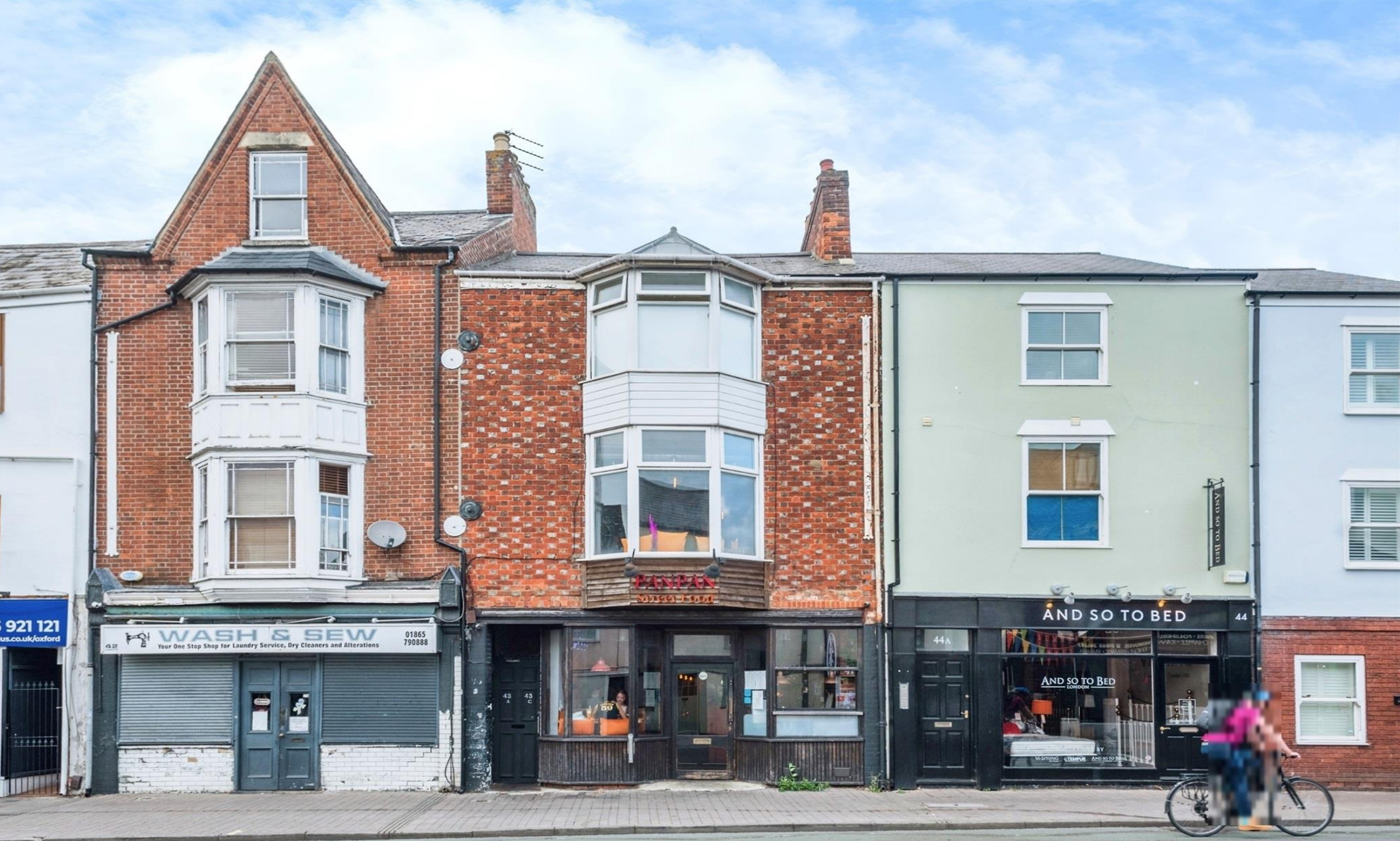
St. Clements Street, Oxford OX4 1AG