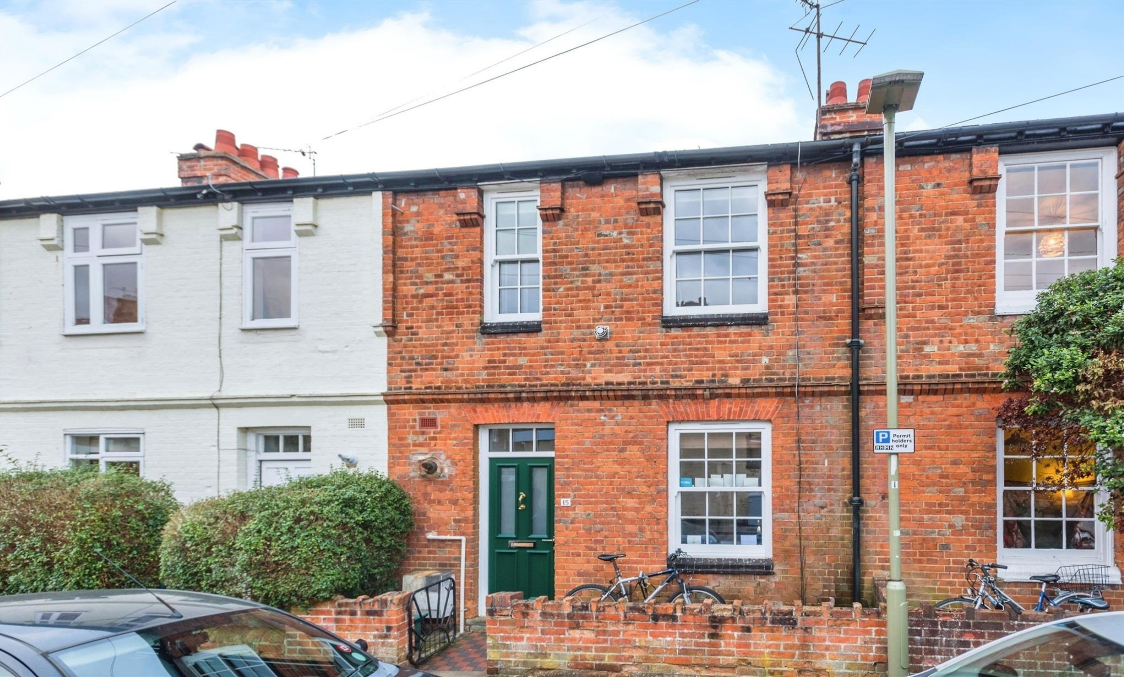
Barnet Street, OXFORD OX4 3AN