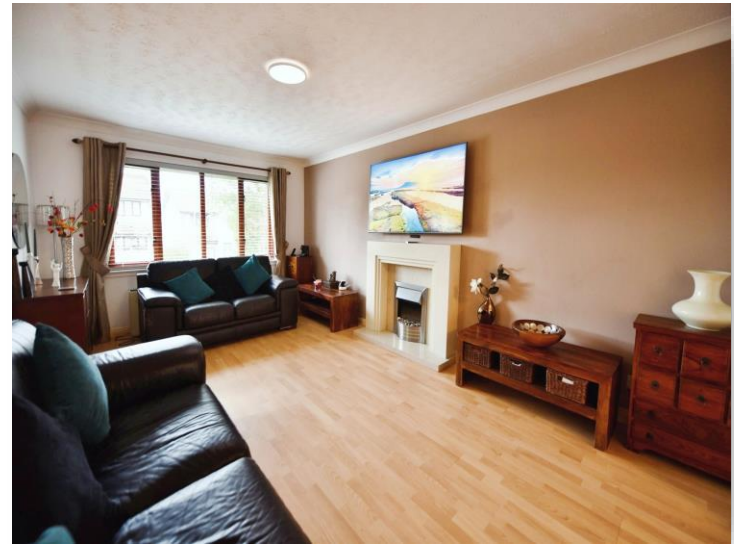
Fairways, Stewarton Kilmarnock KA3 5DA