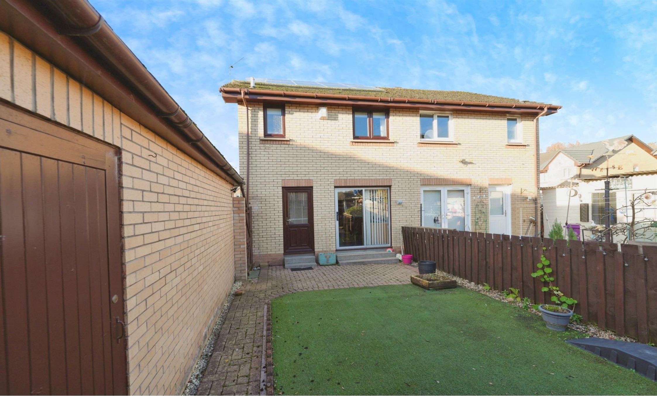
Rosebank Gardens, Lawthorn Irvine KA11 2DL