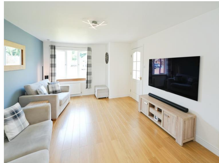
Woodgreen Wynd, Whitehirst Park Kilwinning KA13 6UJ