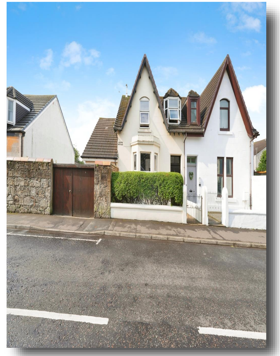
Braehead Place, Saltcoats KA21 5LB