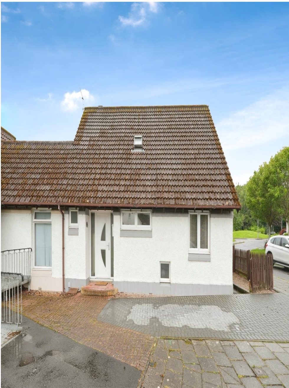
Aberlour Place, Lawthorn Irvine KA11 2BW