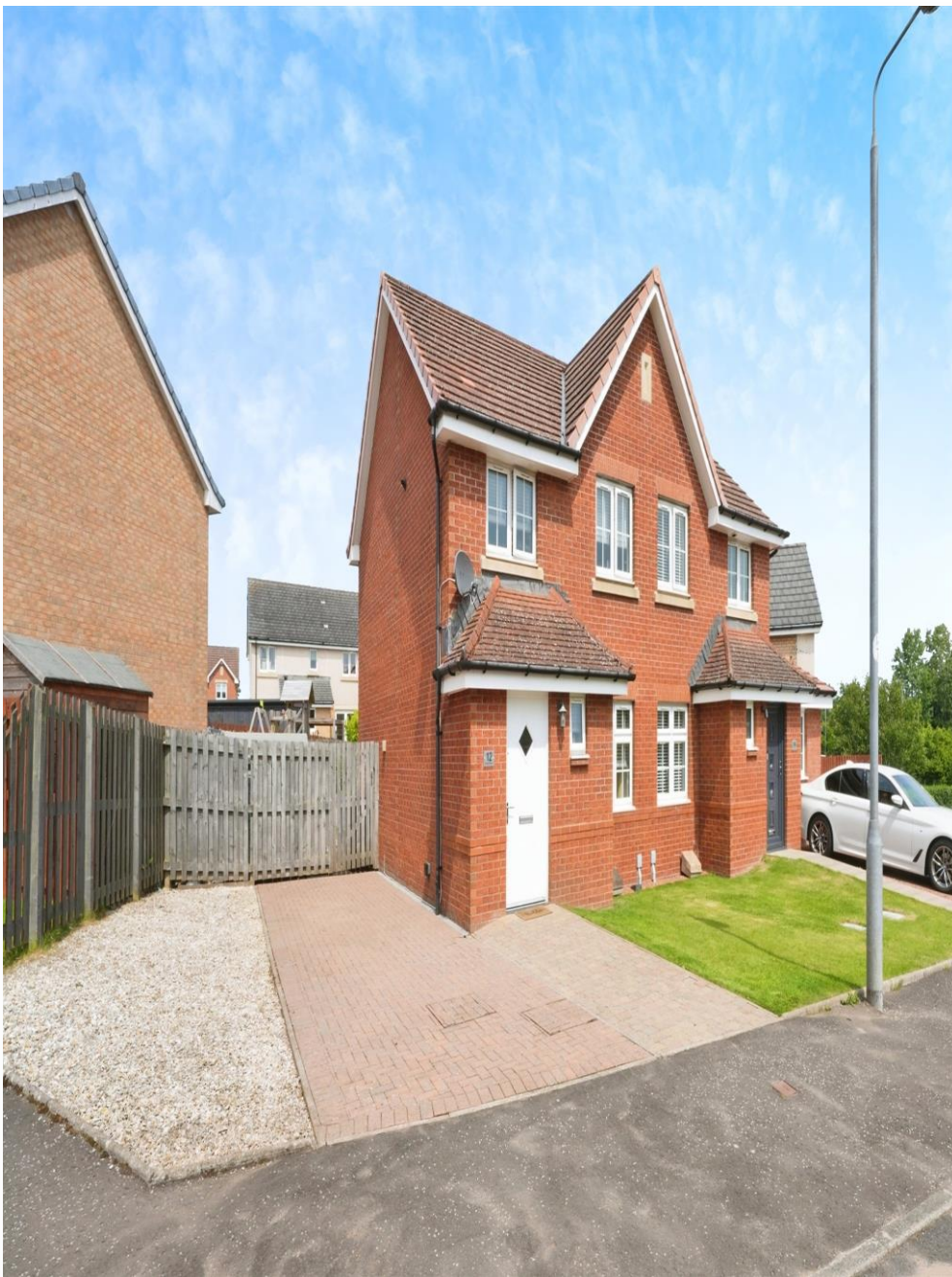
Birklands Wynd, Kilwinning KA13 6NP