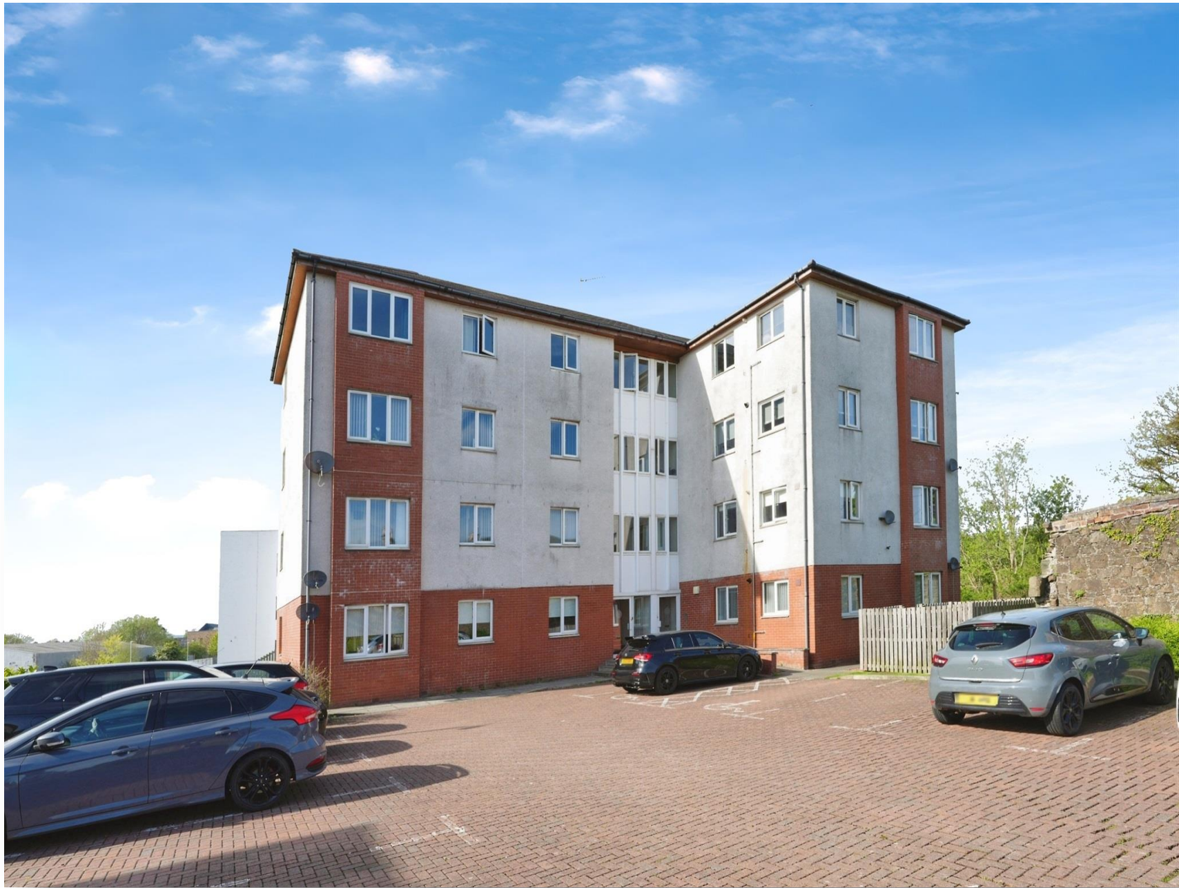
George Court, Irvine KA12 0PJ