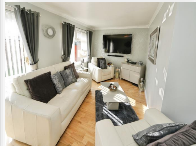
Carron Place, Irvine KA12 9ND