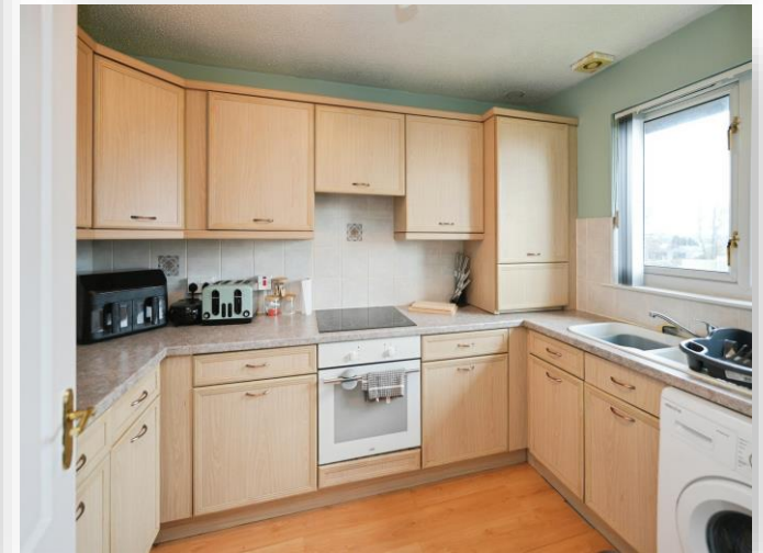
Academy Gardens, Irvine KA12 8BA