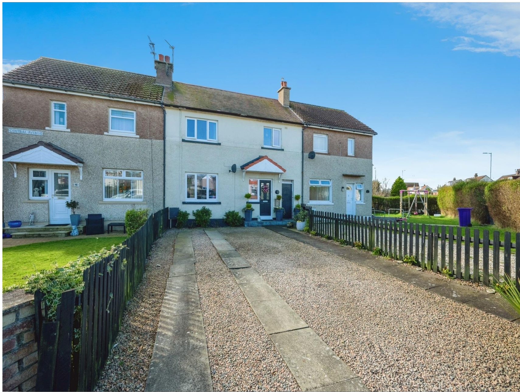
Central Avenue, Ardrossan KA22 7DZ