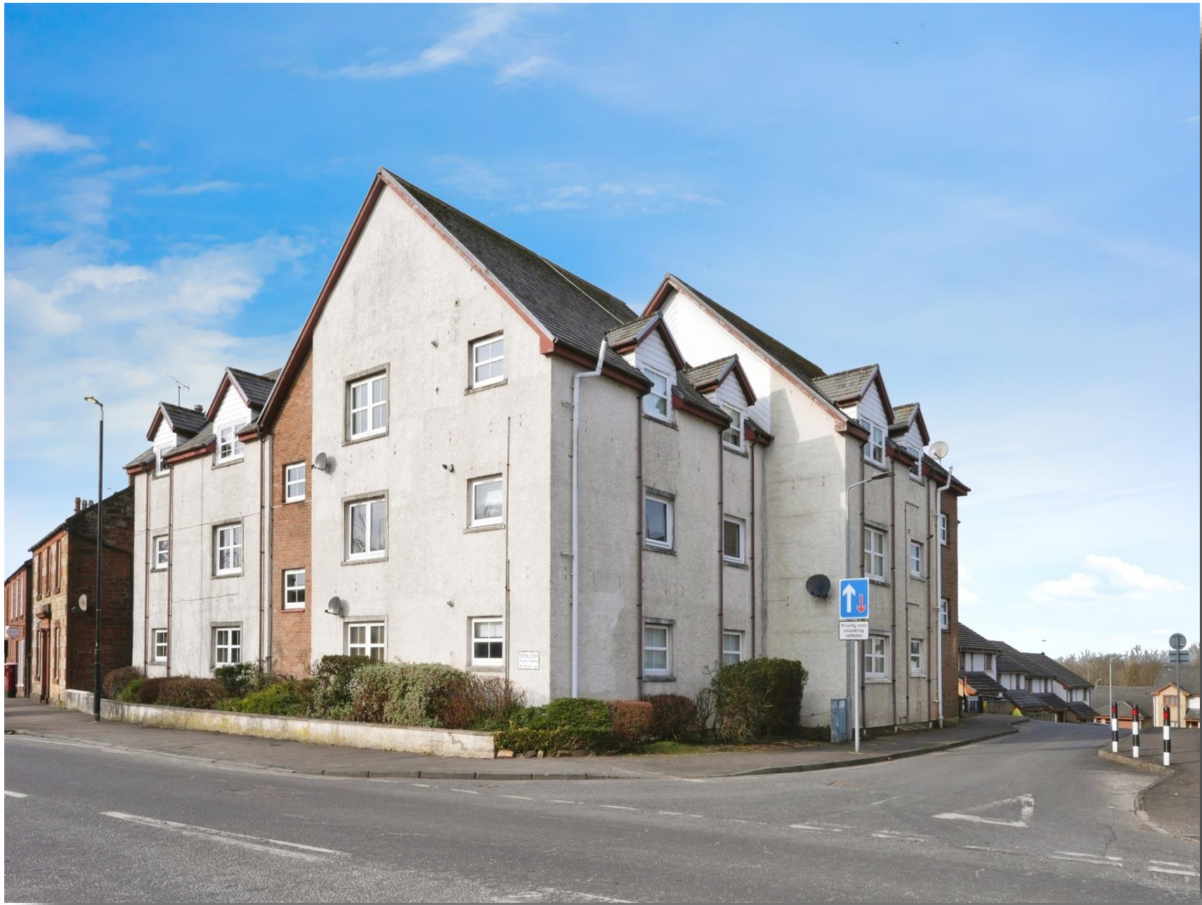
Muirhall Place, Dreghorn Irvine KA11 4DQ