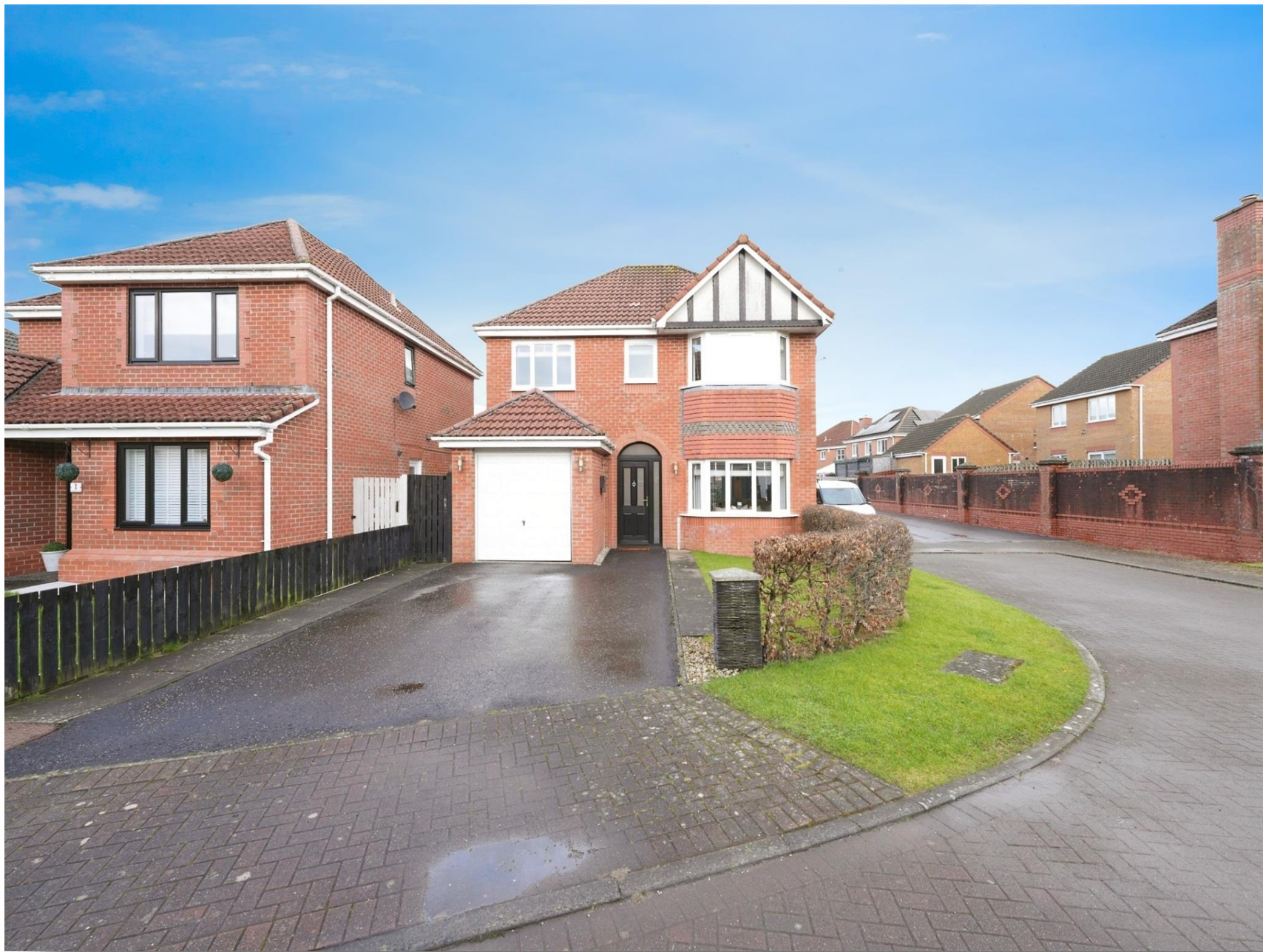
Woodfarm Close, Kilwinning KA13 6DQ