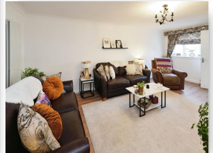
Dornoch Court, Kilwinning KA13 6QN