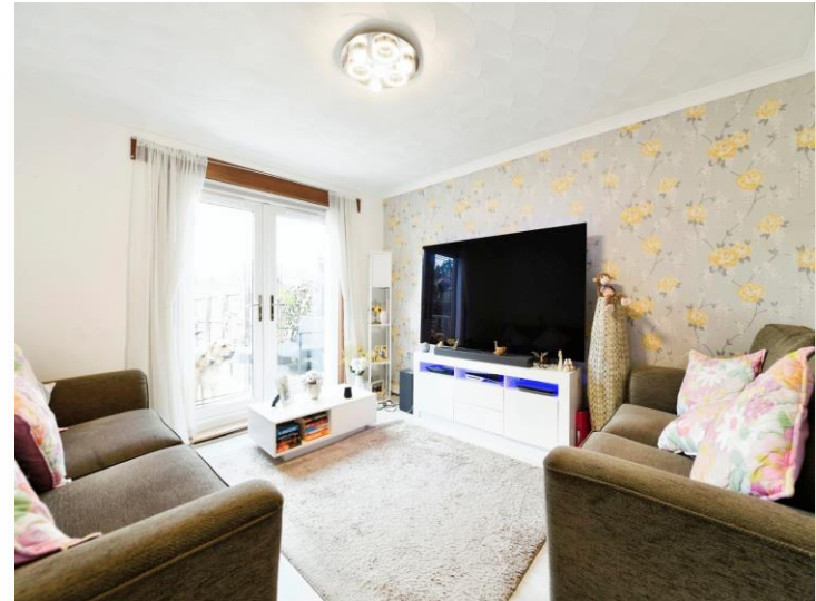
Whitewisp Court, Bourtreehill North Irvine KA11 1LZ