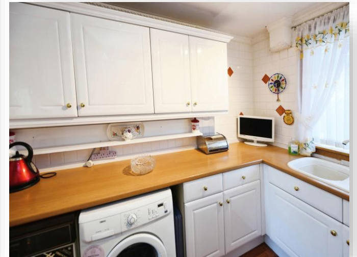
Lanfine Way, Girdle Toll Irvine KA11 1BT