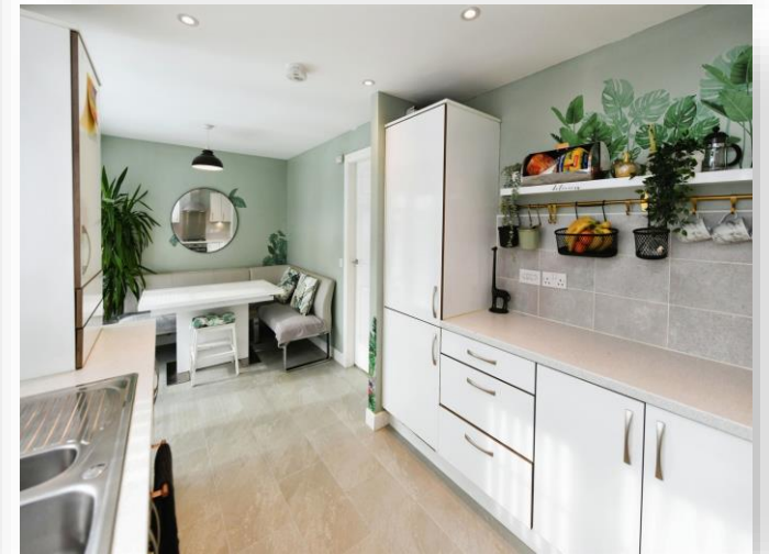
Hawthorn Wynd, Perceton Irvine KA11 2GP