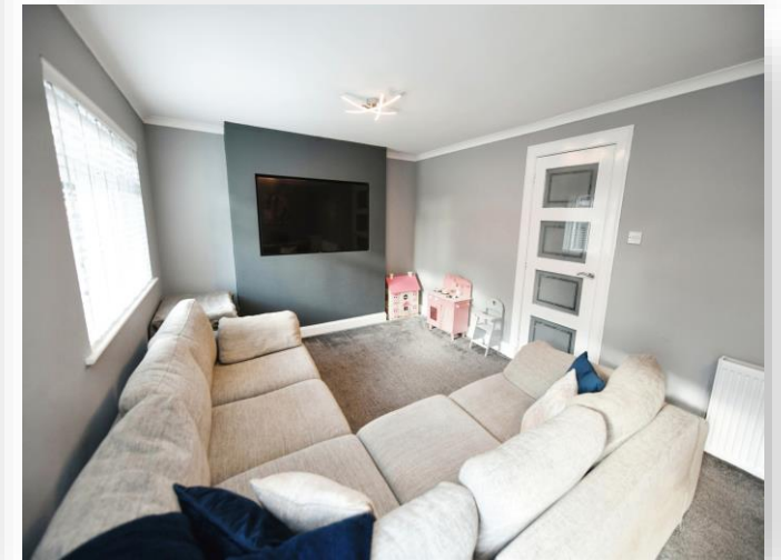
Birkscairn Place, Bourtreehill South Irvine KA11 1ED